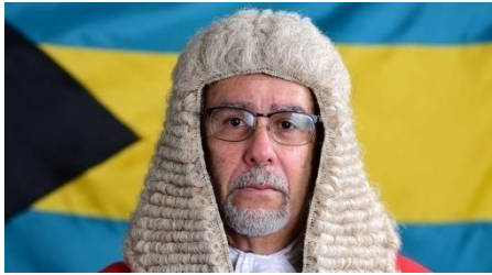
The Honourable Chief Justice Sir Brian M. Moree, Q.C. Chief Justice of the Commonwealth of The Bahamas.

Since his admission as a counsel and attorney to The Bahamas Bar in February 1979, Sir Brian has served on several committees, commissions, boards and tribunals. He has also served two stints as an Acting Stipendiary and Circuit Magistrate and two stints as an Acting Justice of the Supreme Court of The Commonwealth of The Bahamas