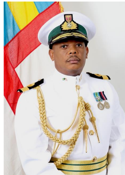
Commodore of The Royal Bahamas Defence Force Mr. Raymond King, EdD