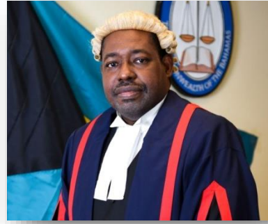
By: Deputy Chief Magistrate, Mr. Andrew Forbes

The Novel Corona Virus known as "COVID-19" has impacted the magistracy in a very significant way. Firstly It is known that magistrates courts handle a substantial volume of matters, traffic, domestic more specifically (domestic-violence) hearings, small claims civil matters specifically the large volume of Landlords and Tenants claims and the arraignment of all criminal matters whether indictable or misdemeanors offences.