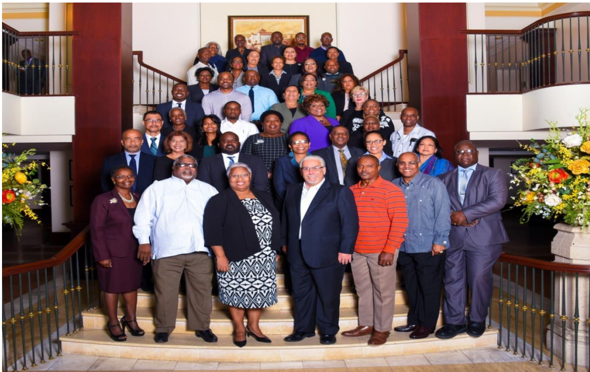
The Honourable Chief Justice and Judicial Officers