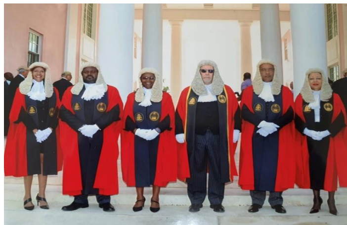
The Honourable Chief Justice and Justices of The Supreme Court The proceedings to mark the first sitting in the legal year in the Northern Region, 2020

We are, however, grateful that with the assistance of RAM and some members of the Bar, many files have been copied and restored and or reproduced. 2020 got off to a great start. The proceedings to mark the first sitting in the legal year in the Northern Region went well.