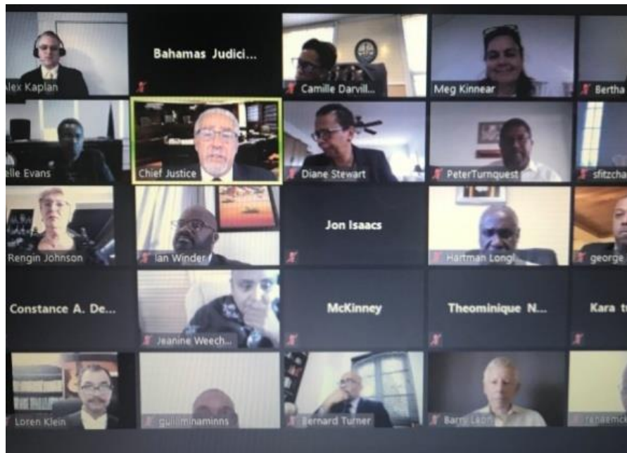
VIRTUAL PARTICIPANTS Arbitration & Mediation Training