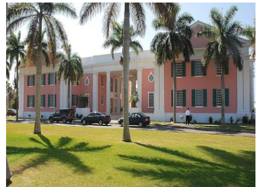
Garnet Levarity Justice Centre Freeport, Grand Bahama

We believe that our future is smoother than the past twenty-one (21) months, God willing but if not, we know where we have been brought from and whose hands we hold – TRIUMPHLY!